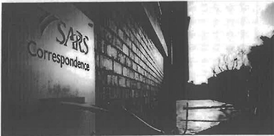
SARS branch. File photo.

he second-in-command at the South African Revenue Service has been flagged for "suspicious and unusual" cash payments into his bank account, with a report recommending an investigation to determine if the payments are "proceeds of crime arising from