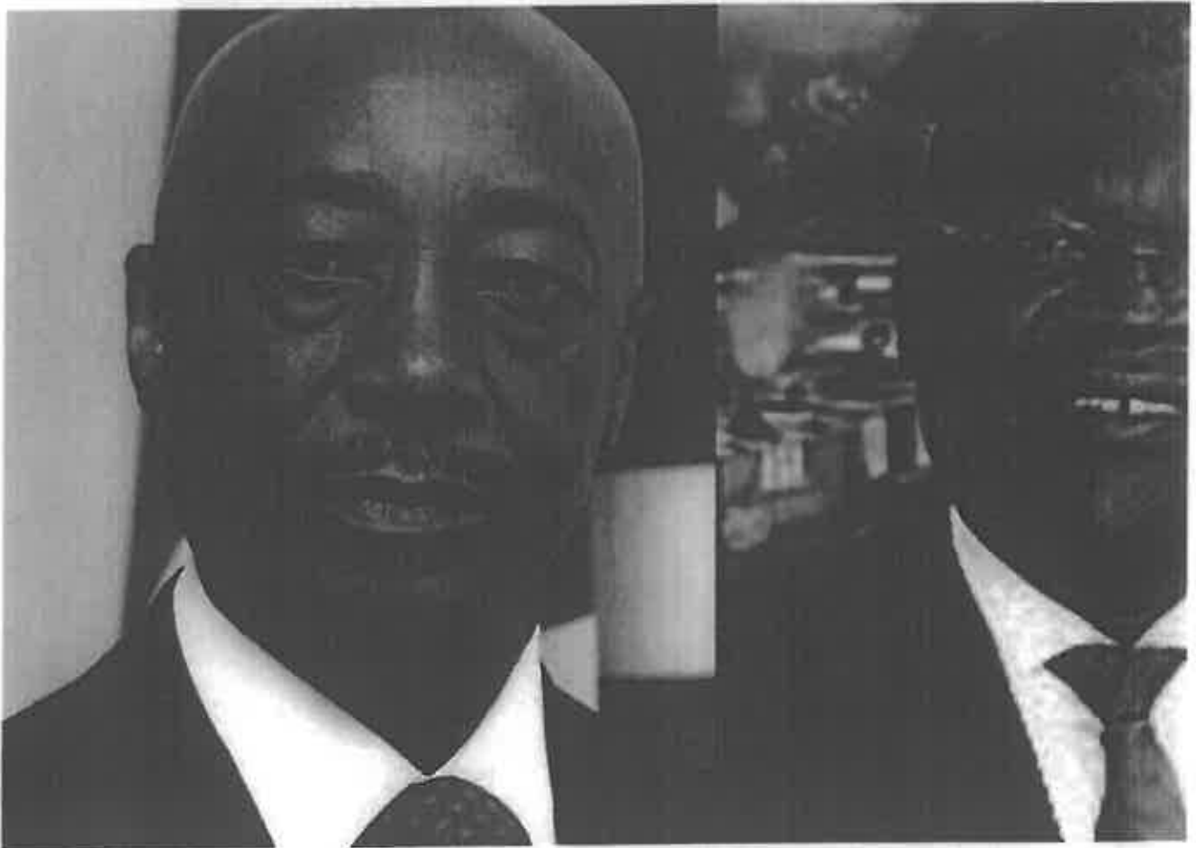
SARS Commissioner Tom Moyane and Hawks head Lieutenant-General Mthandazo Ntsemeza have known for more than three months about the alleged