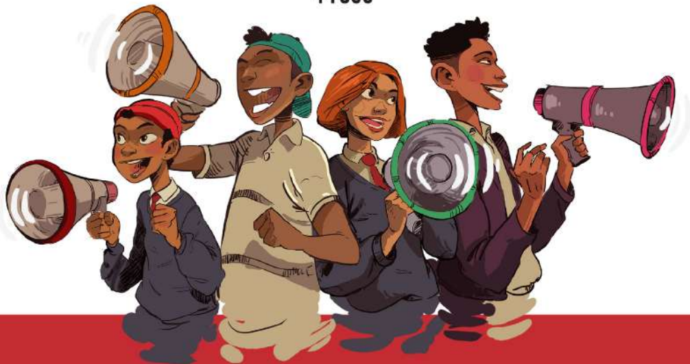
AGENT ORANGE DESIGN

info@corruptionwatch.org.za T. 011 242 3900 | F. 011 403 2392