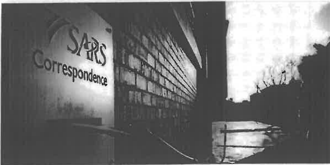
SARS branch. File photo.

he second-in-command at the South African Revenue Service has been flagged for "suspicious and unusual" cash payments into his bank account, with a report recommending an investigation to determine if the payments are "proceeds of crime arising from