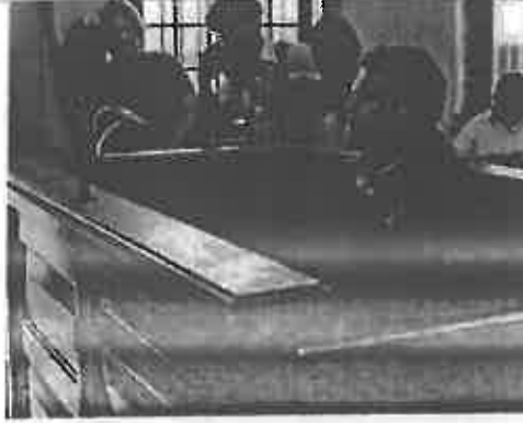
Murder accused multimillionaire fights top property firm's bid to dump him