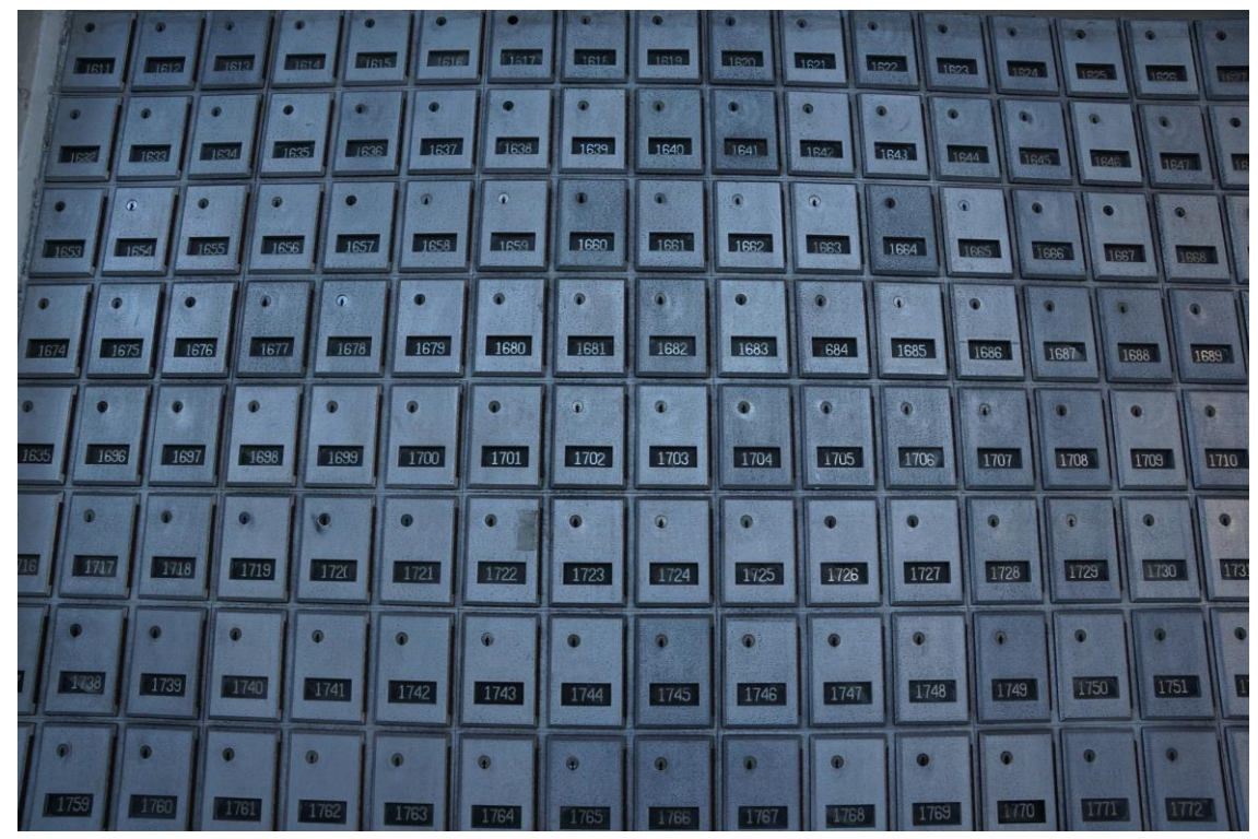
It is common for shell companies to be registered at an address that is nothing but a mailbox. This is a photo from the Cayman Islands.

In short, the average large-scale corrupt deal is only possible because it is too easy to set up and manage a company without having to provide information about the real, natural person who benefits from it – technically known as the "beneficial owner". <sup>5</sup> Crucially, this high-risk loophole is not limited to offshore jurisdictions. While there are locations which have specialised in the wholesale supply of anonymous legal structures, virtually all countries have weaknesses to varying degrees, including major economies.