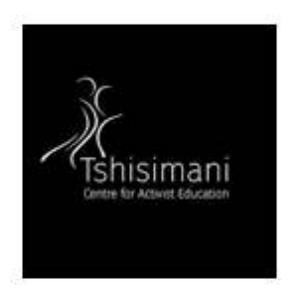
120. Tshisimani Centre for Activist Education